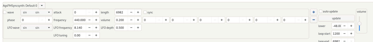
The frequency modulator synced synth screenshot

Produce audio data using its oscillators. The count of oscillators can be adjusted by clicking add/remove. You have on the right the option to auto-update changes you do with the controls or do it manually by the update button. Loop start and loop end allows you to specify what region of the audio data shall be looped in order to get the desired note length.