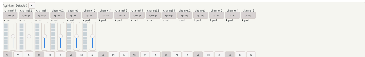
The mixer screenshot

Bundle audio lines with the mixer and perform toplevel stream manipulation. It contains per audio channel a volume indicator and may contain LADSPA or Lv2 plugins.